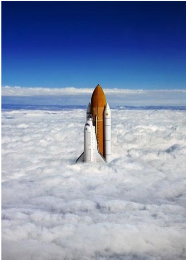
Space shuttle rising out of the clouds