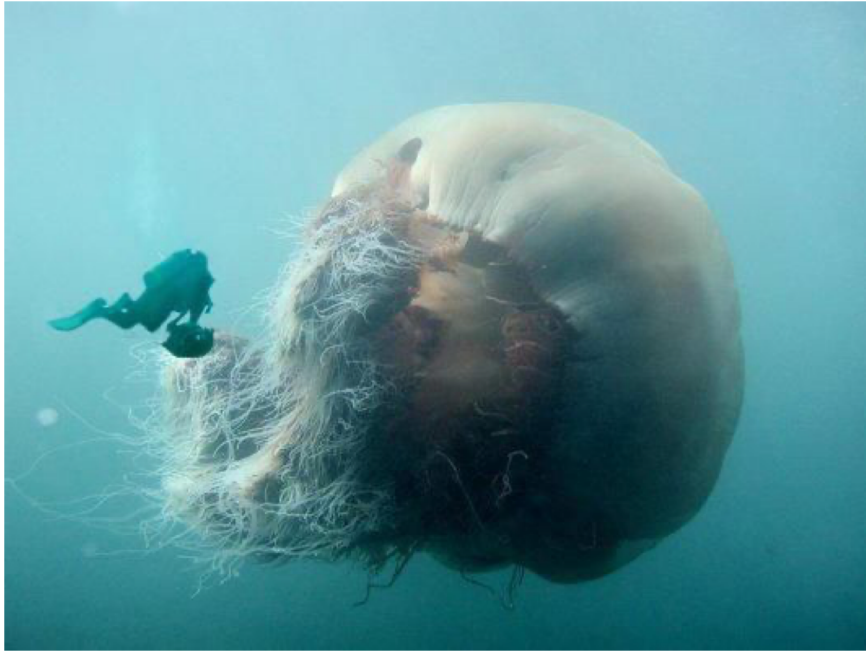
Lion's Mane Jellyfish