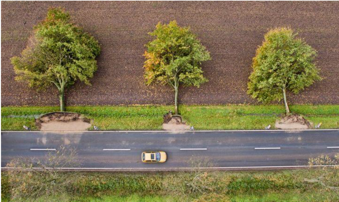
Fallen down trees after a hurricane.