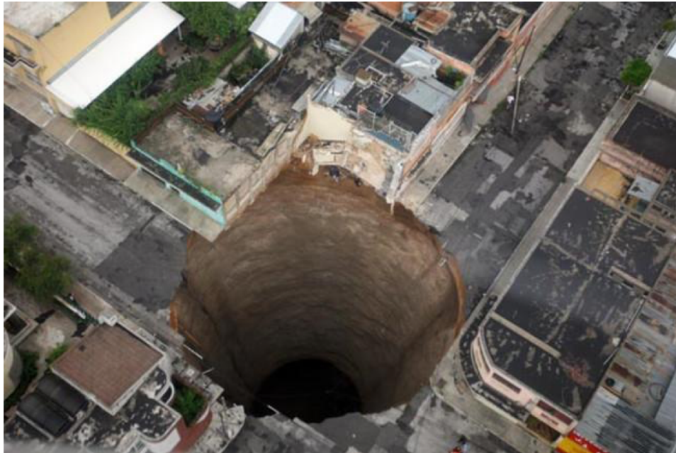
Sinkhole in Guatemala, 2010.

It's Real!