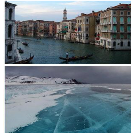
Fake! It's actually made up of two different photos.