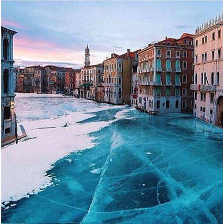
Venice frozen over.