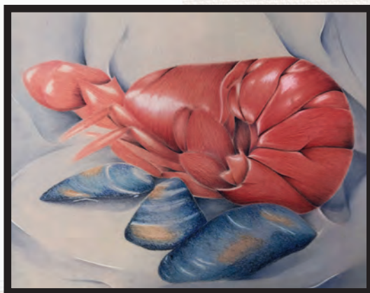
By Aisling Coase